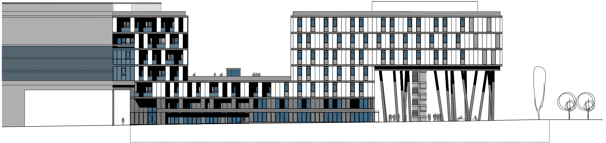
ALÇAT C/TORDERA e: 1/500