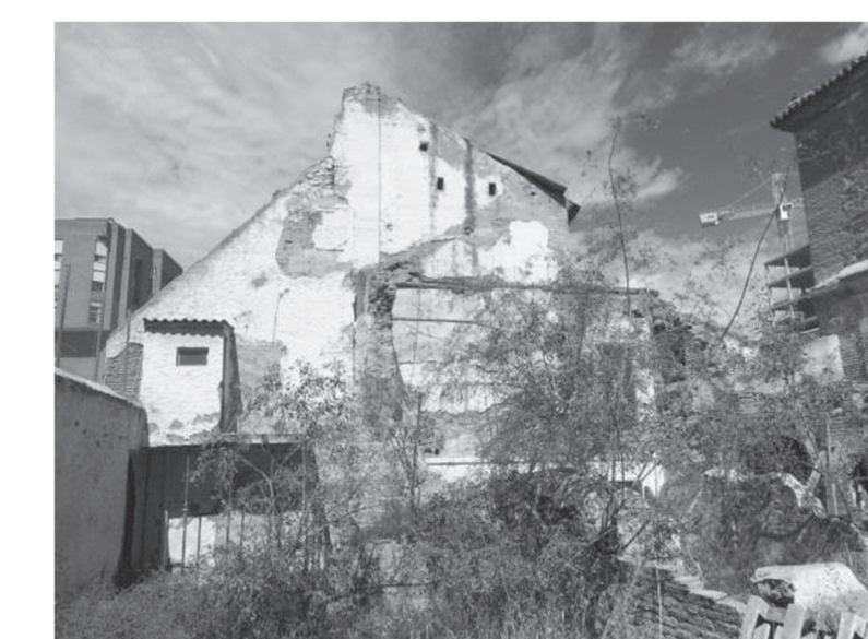
ALZADO EXTERIOR *D*