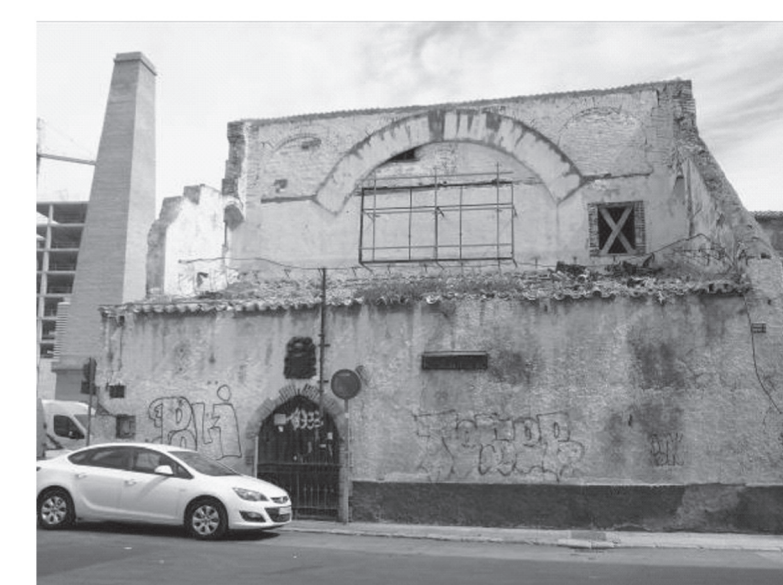
ALZADO EXTERIOR *C*