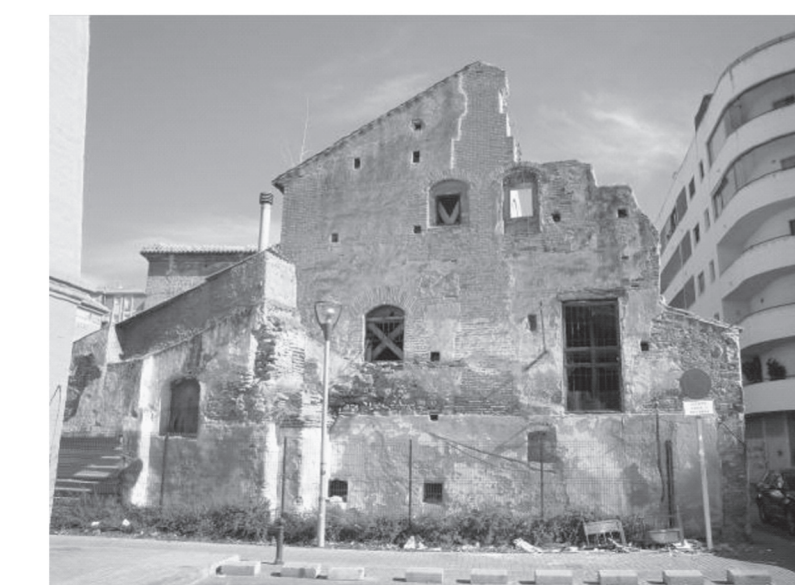
ALZADO EXTERIOR *B*