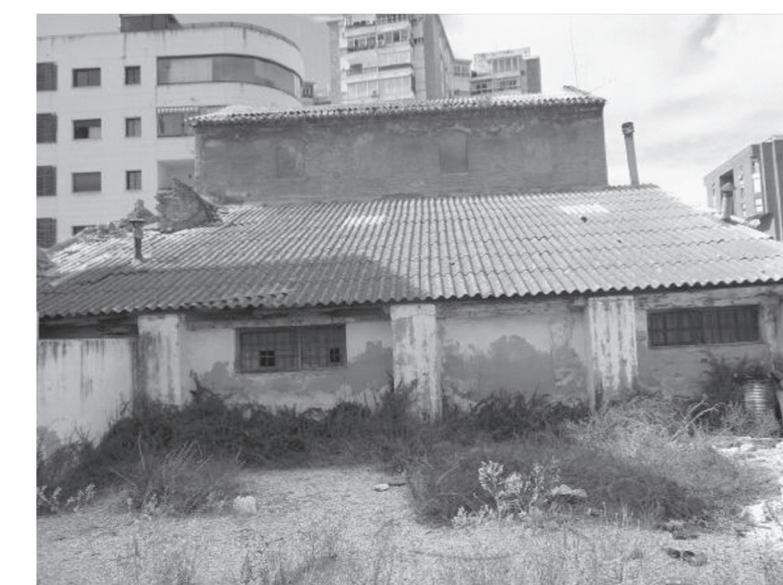
ALZADO EXTERIOR *A*