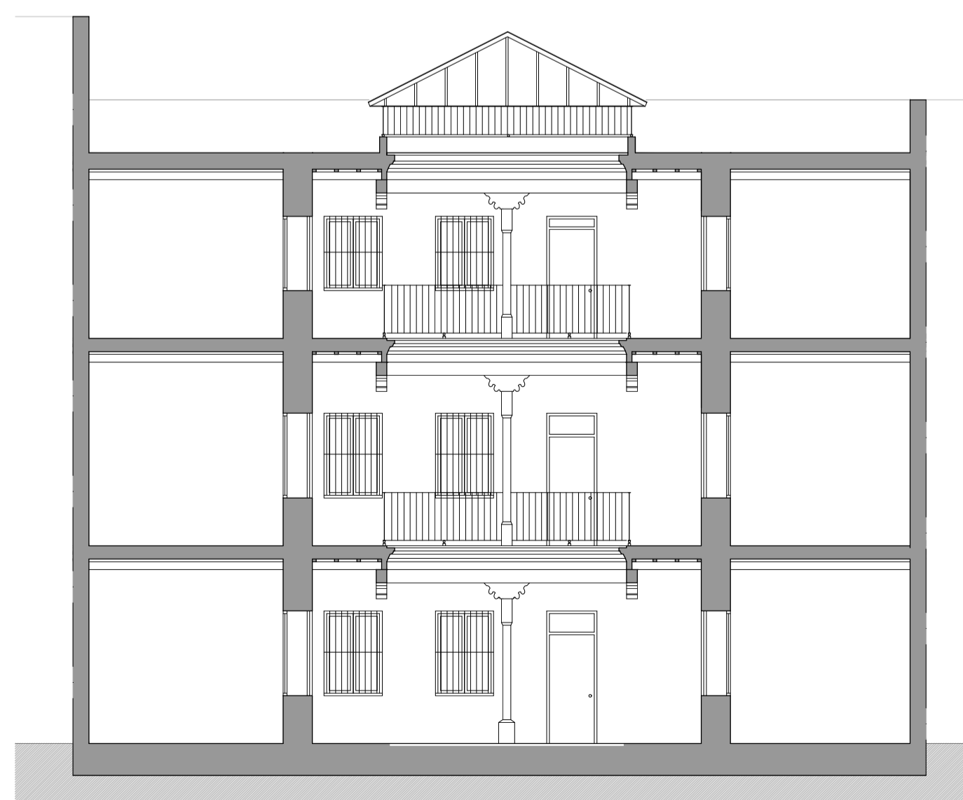
SECCIÓN TRANSVERSAL 2-2