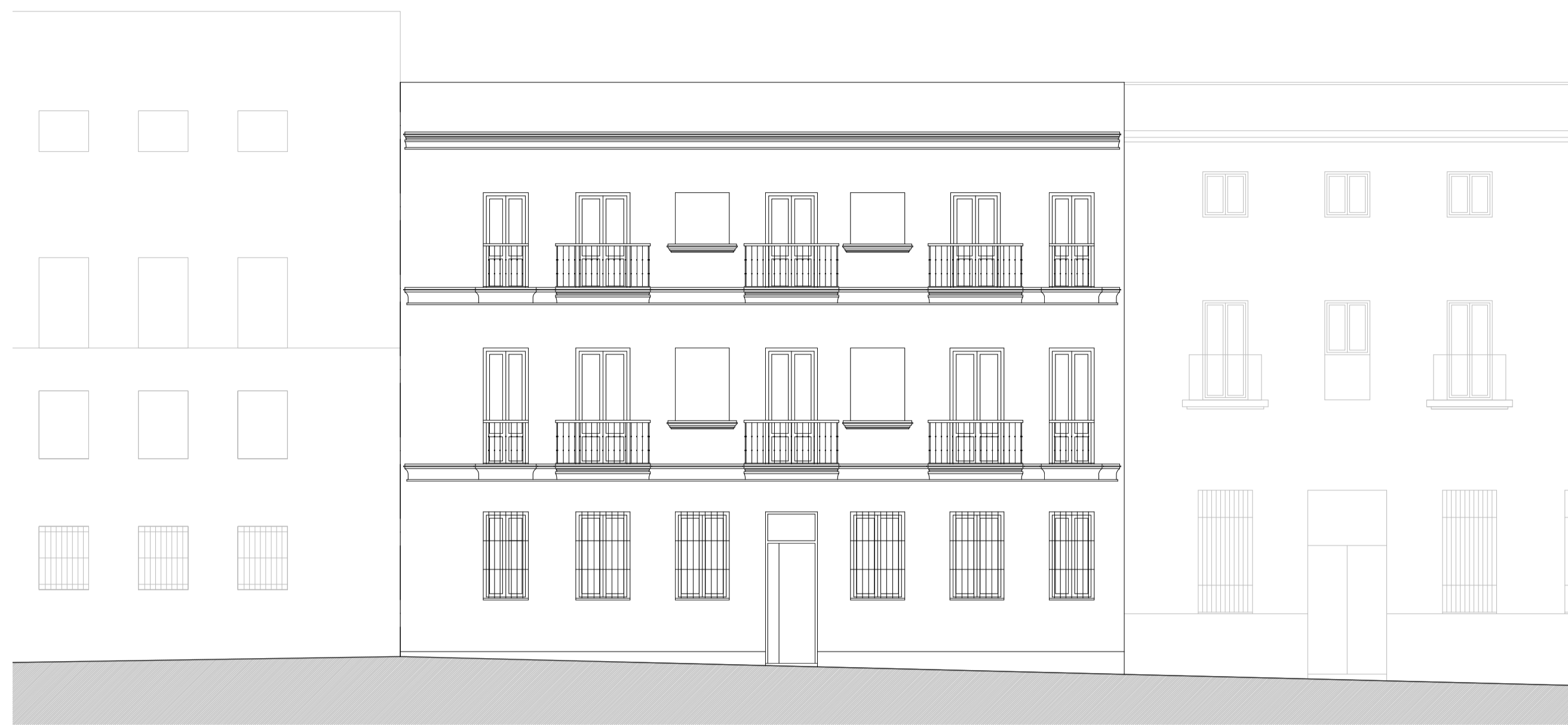
FACHADA A CALLE BOTICA.