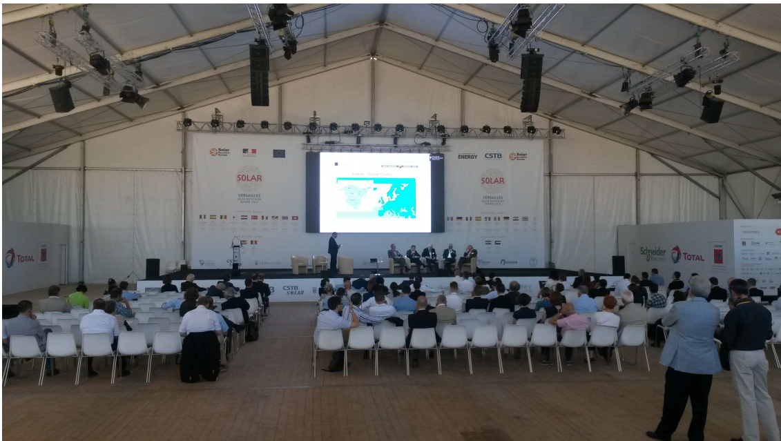
Photograph of the workshop in the CECODHAS conference