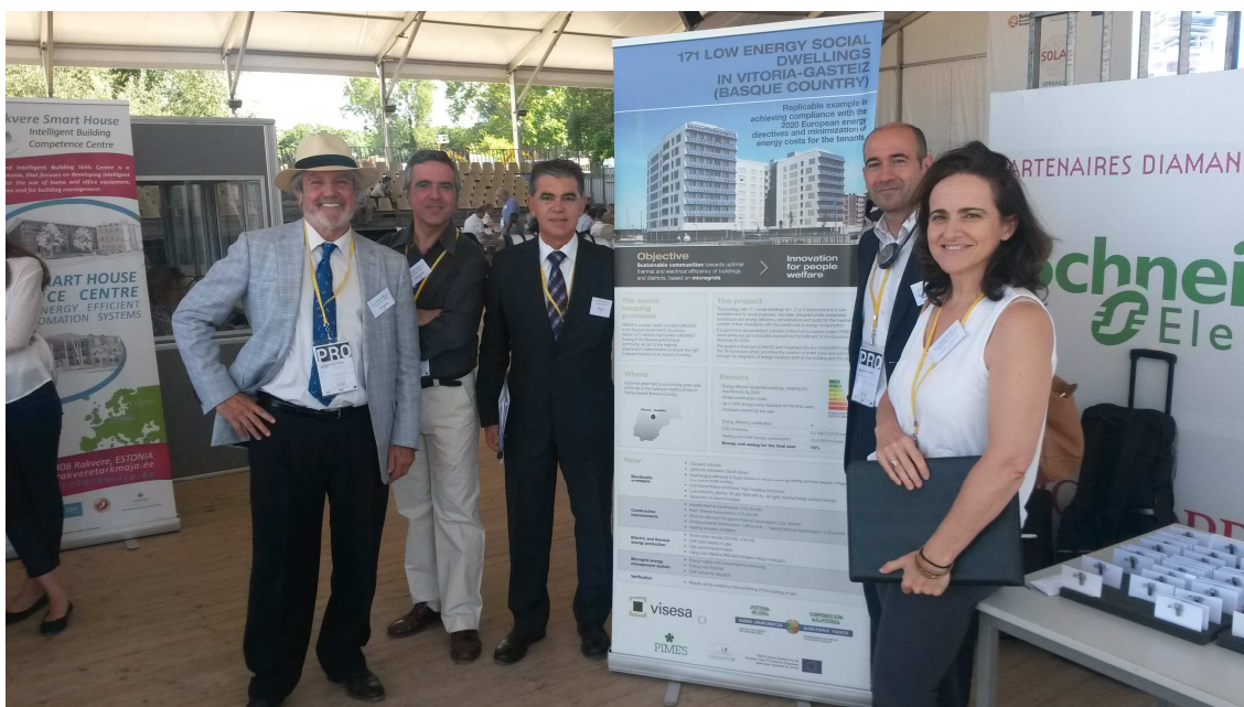
A roll-up of the 171 subsidized dwellings was exposed during the conference