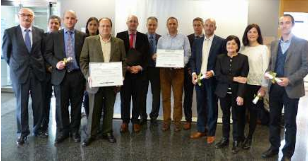
All the finalist of the six selected companies in the Meeting with their Diplomas