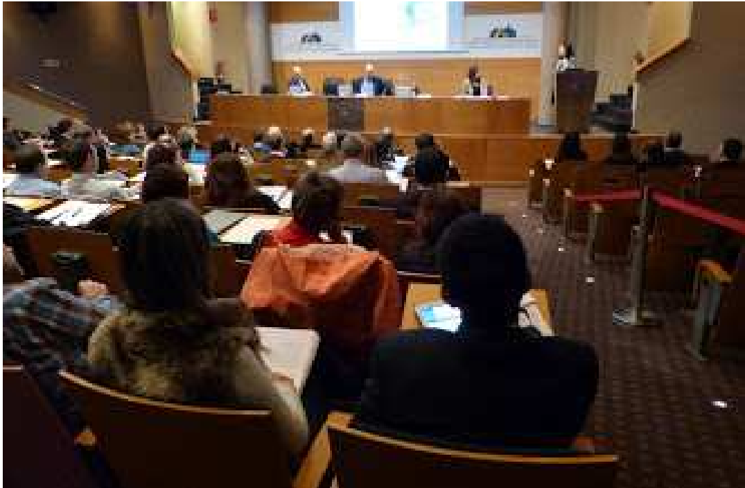
Photograph of the "Meeting of good practices on Internationalization EUSKALIT 400 Club"