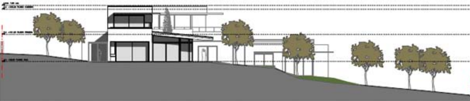
FAÇANA LATERAL 02