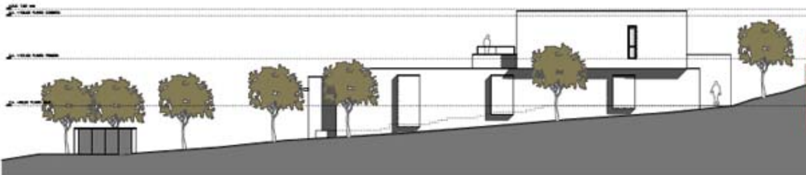
FAÇANA LATERAL 01