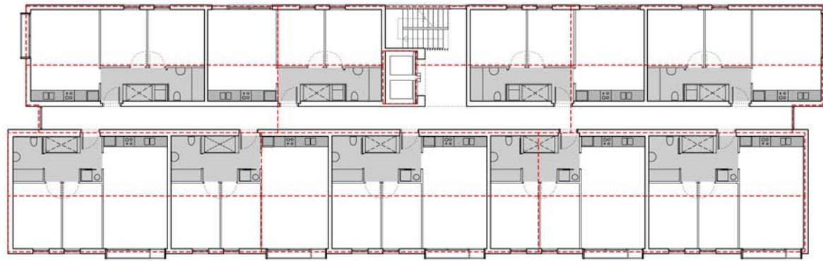
PT PLANTA TIPUS