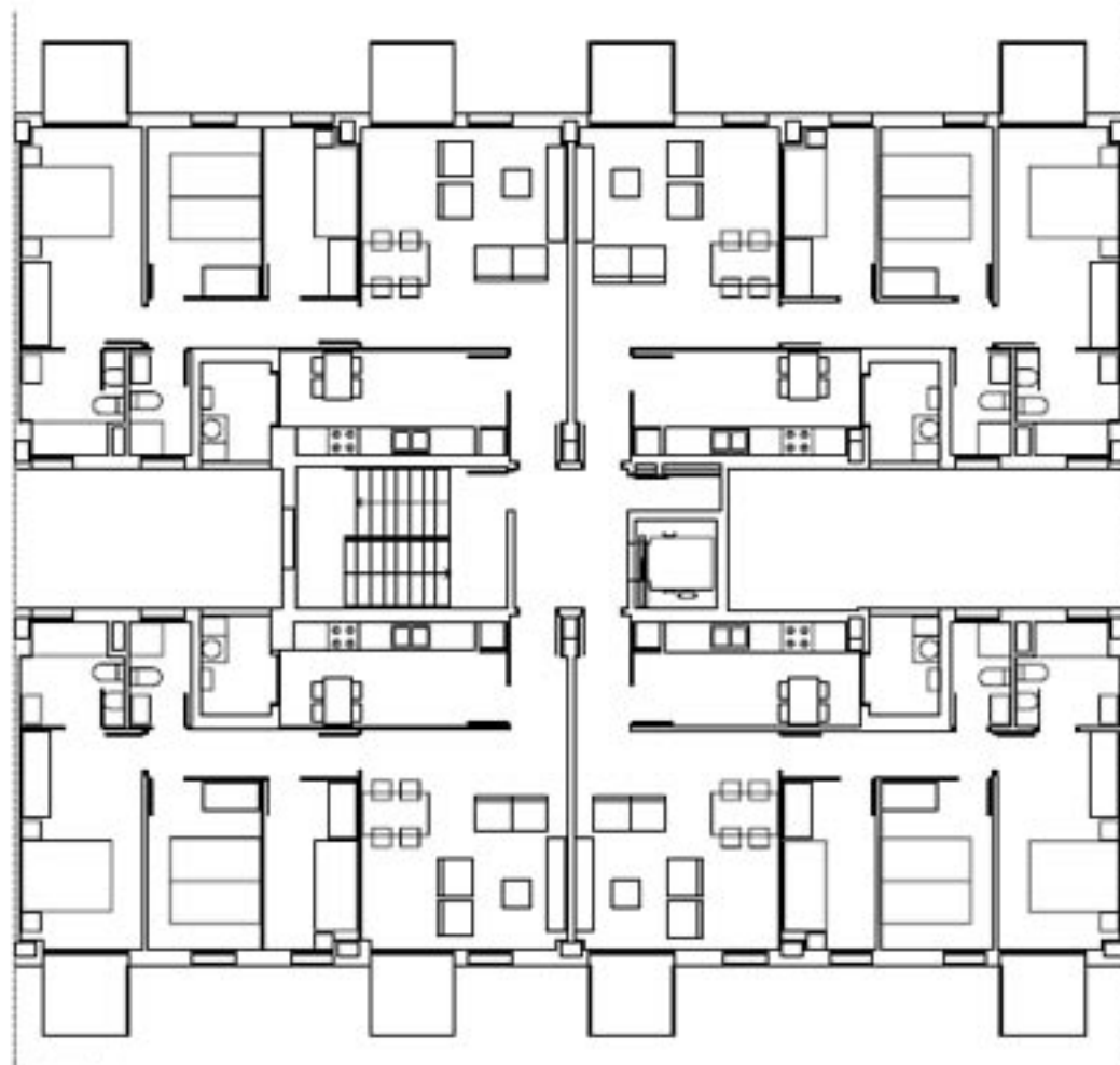
PLANTA MÓDUL TIPUS