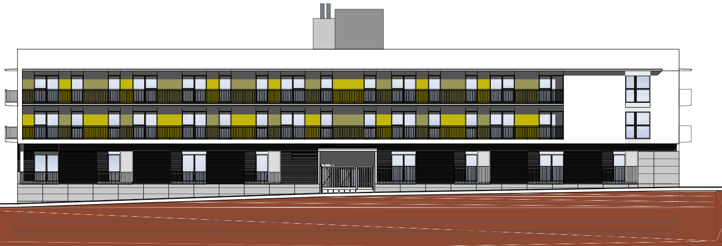
ALÇAT EST. e.: 1/300